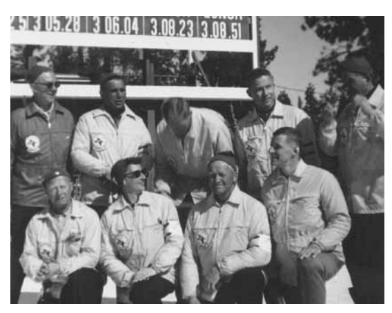
1960 Winter Olympic, cross-country course staff