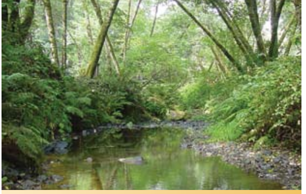
Little River, Van Damme State Park

The Pomo date back about 3,000 years on the North Coast. They built their main village of redwood bark houses at the mouth of Big River. The Pomo hunted large and small game, caught fish and shellfish, and