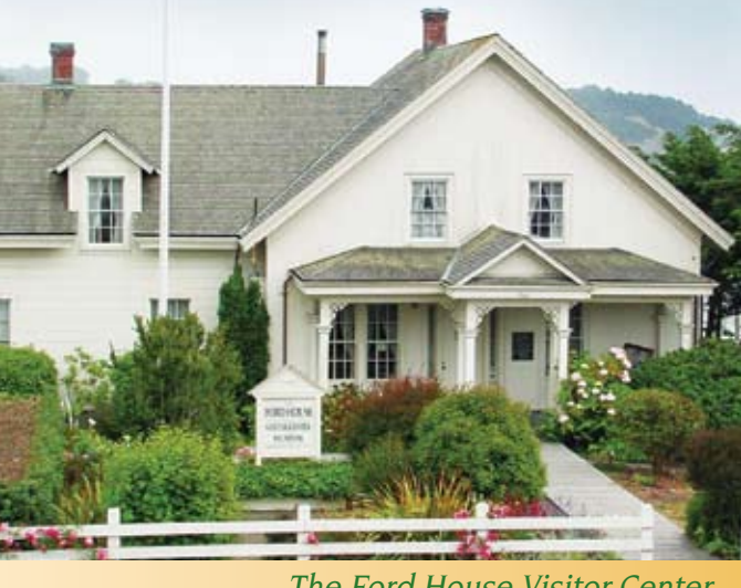
The Ford House Visitor Center

The State acquired a portion of the headlands in 1957, and in 1974, through the