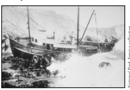
Shipwrecked Junta, 1938, at Point Reyes Headlands.

Because of this ongoing problem, a lifesaving station was established on the Great Beach north of the lighthouse in 1890. Men walked the beaches in four-hour shifts, watching for shipwrecks and the people who would need rescue from frigid waters and powerful currents. This lifesaving station was later moved to Drakes Bay near Chimney Rock and was active until 1968. Today, it is a National Historic Landmark